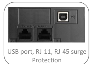
USB port, RJ-11, RJ-45 surge Protection