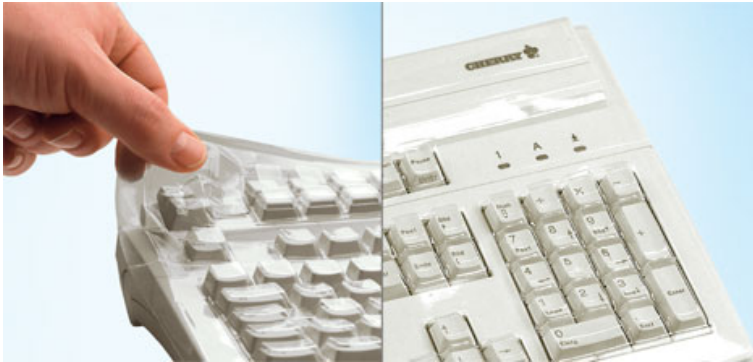
Models may vary from the image shown

Errors, technical changes and delivery possibilities excepted. Technical information refers only to the specifications of the products. Features may differ from the information provided.