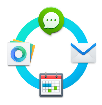
Synology Collaboration Suite

Virtual Machine Manager implements various virtualization solutions, allowing you to manage multiple virtual machines on your FS1018, including Windows , Linux , and Virtual DSM .