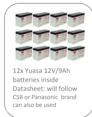
12x Yuasa 12V/9Ah batteries inside Datasheet: will follow CSB or Panasonic brand can also be used

Version: EN 24/09/2015 We reserve the right for technical changes and mistakes