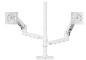
LX Dual Stacking Arm, Tall Pole