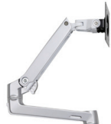
SILVER WITH WHITE ACCENTS #98-130-231