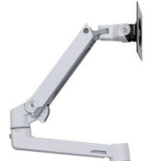
WHITE WITH GREY ACCENTS #98-130-216