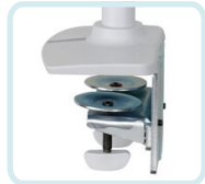
INCLUDED WITH LX DUAL STACKING ARM, TALL POLE: HEAVY-DUTY 2-PIECE DESK CLAMP ATTACHES TO SURFACE EDGE