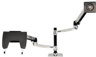
NOTEBOOK TRAY KIT SHOWN ABOVE IS INCLUDED WITH THE POLISHED ALUMINUM LX DUAL STACKING ARM #45-248-026

FOR ALL OTHER LX DUAL STACKING ARMS, THE NOTEBOOK TRAY KIT CAN BE ORDERED SEPARATELY #50-193-200 (AVAILABLE IN BLACK ONLY)