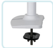
INCLUDED WITH LX DUAL STACKING ARM, TALL POLE: GROMMET MOUNT KIT ATTACHES THROUGH SURFACE HOLE