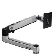
POLISHED ALUMINUM WITH BLACK ACCENTS #97-940-026

REQUIRED TO ADD A THIRD AND FOURTH ARM TO THE TALL POLE VERSION