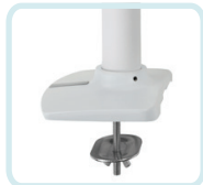
WHITE GROMMET MOUNT KIT ACCESSORY #98-035: ATTACHES THROUGH SURFACE HOLE