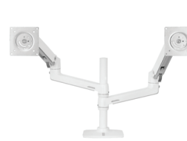
LX Dual Stacking Arm