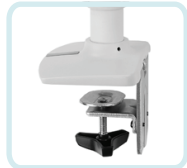
INCLUDED WITH LX DUAL STACKING ARM: STANDARD 2-PIECE DESK CLAMP ATTACHES TO SURFACE EDGE