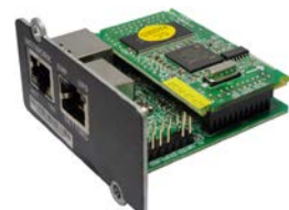
10120599 - Mini NMC Card