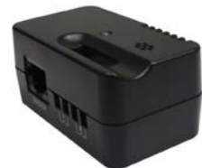
10120545 - EMD for NMC Card