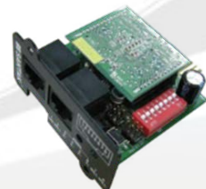
10120592 - Mini Modbus Card 3