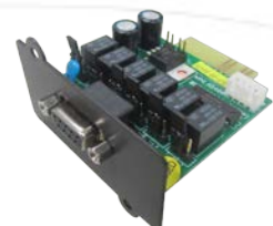
10120597 - Mini AS400 Card 4