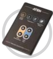
IR Remote Control Included