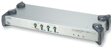
Model: CS-9134 4 Port PS/2 KVM Switch