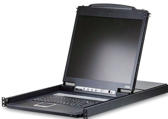
CL1316 Front view