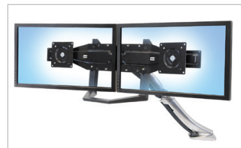
Dual Monitor & Handle Kit (black) 97-718-009