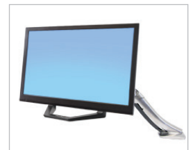
Monitor & Handle Kit (black) 97-760-009